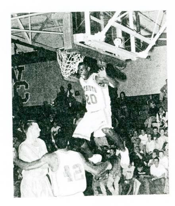
In your face!