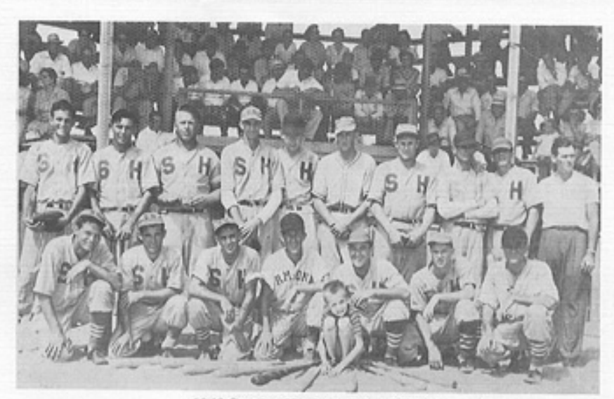
1948 Straits-Harkers Island Team

"I can remember when we'd go to Harkers Island ... They'd say, 'Mo' - pitching, 'Snowball' - catching, and 'Tookie' on first ..." Gerald Whitehurst