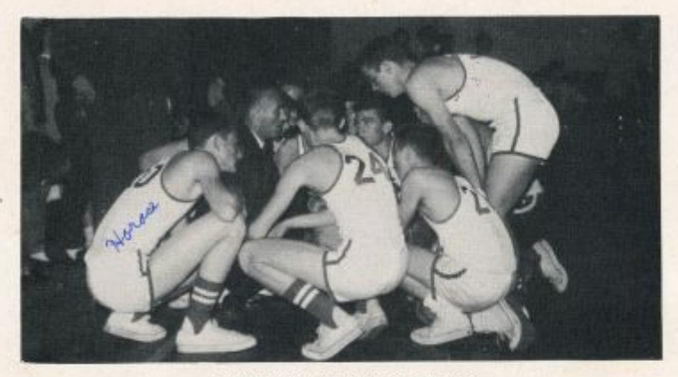
LAST MINUTE INSTRUCTIONS