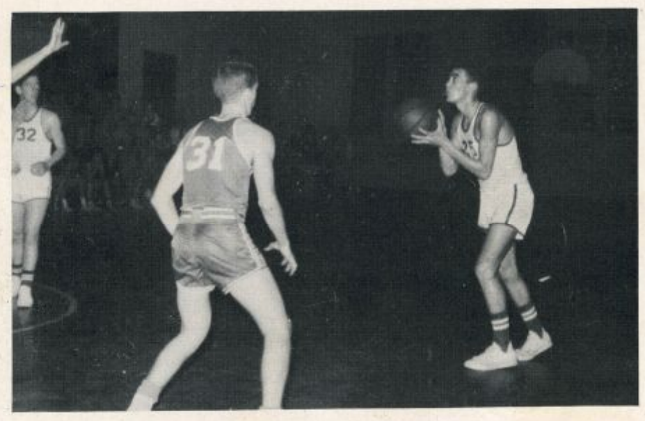
GO BLUE DEVILS! GO!